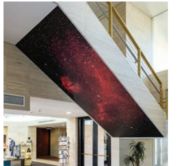
(top) “Rosette Nebula (August 20, 2023),” Phil Rosenberg (American, b. 1946), Astrophotograph of 23 images. (bottom) “Seagull Nebula (August 10, 2023),” Phil Rosenberg (American, b. 1946), Astrophotograph of 90 images.