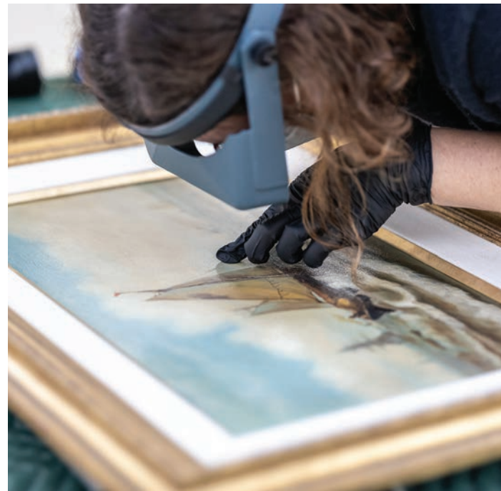
(left) Donations to the Appleton support free programs for schools and organizations like Kut Different and Boys & Girls Clubs, as well as (right) conservation efforts that ensure the artwork and facility will serve generations to come.

supporting the museum in future goal planning. A gift of publicly traded securities could be right for you if: