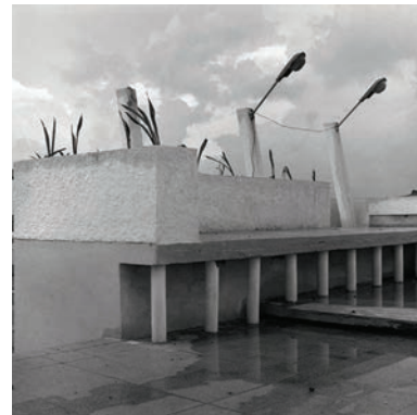
(left to right) "Río Duaba," "Cathedral Interior" and "Platform at la Punta," all from the "Shared Vision of Cuba" series, 2004, Gelatin silver prints, 19 x 19 in., Gift of the artist, Florida Institute of Technology 2021 transfer.